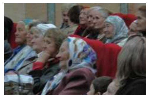
Babushkas at a concert organized for babushkas on the 1 st of October

To celebrate International Day of Older People on the 1 st of October, Babushka Adoption organized a concert for its beneficiaries and other elderly. The most talented opera and pop singers from Kyrgyzstan participated in the concert voluntarily. Our beneficiaries had an opportunity to listen to both Soviet retro and modern music. The event was very special for our beneficiaries because they cannot themselves afford to attend such cultural events.