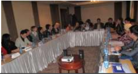
Round Table by Babushka Adoption “Improvement of the image of the elderly”

Over the last two years Babushka Adoption has consciously taken a more active position in protecting the rights of older people. We include our older people in decision making processes.