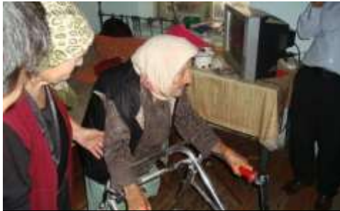
Walking aids presented by “Tian Shan” Foundation

Babushka Adoption Foundation works with other charity organisations to distribute humanitarian aid to senior citizens in Kyrgyzstan.