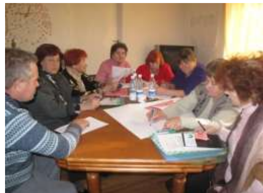
Babushkas are at a training “Building of advocacy strategies”