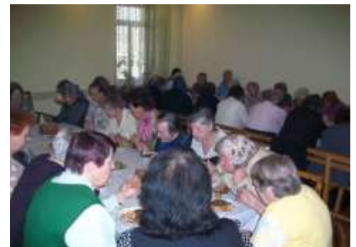
Babushkas have lunch, prepared by Church of Jesus Christ, Bishkek

An exciting new opportunity has arisen recently for our babushkas to be able to meet together and enjoy a hot meal on