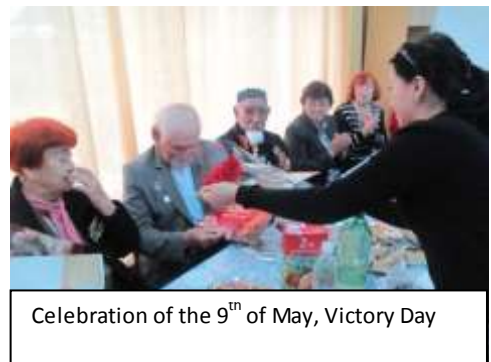
Celebration of the 9 th of May, Victory Day

On the 11th of May BA staff members organized a celebration of the 66 th anniversary of the Great Victory in the Second World War. The event took place at our Elderly Initiatives Support Centre in Belovodskoe village in the Chui region, 40 km from the capital city of Bishkek. Three war veterans, members of Babushka Adoption’s Self Help Groups and a local choir “Pamyat” (translated from Russian as “Memory”) took part in the celebration. The war veterans reflected on their experiences of war and about the first Victory Day.