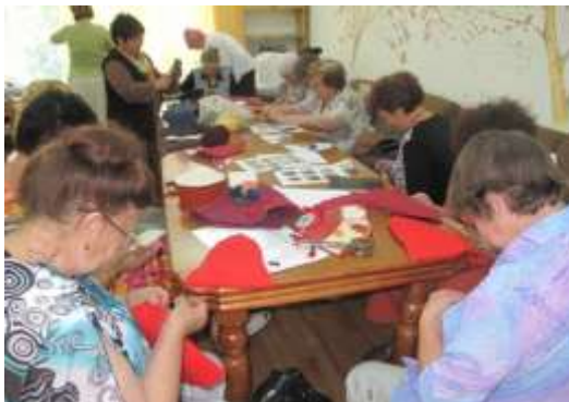
Babushkas are at a training “Making cloths out of felt”

Babushka Adoption continues to support Self Help Groups in Bishkek and Batken district. These groups consist of 10-15 elderly people who meet regularly to discuss old people’s needs, address the problems of social reintegration and participate in community development activities at local level.