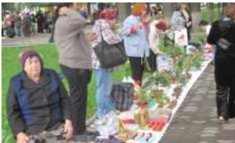
Fair, where the babushkas are selling handmade stuffs

Members of our SHGs read monologues about war. The choir “Pamyat” sang war songs. BA staff congratulated everybody and thanked veterans for their contribution to victory, presenting memorable cards and flowers. After the formal celebration all the guests were invited for tea.